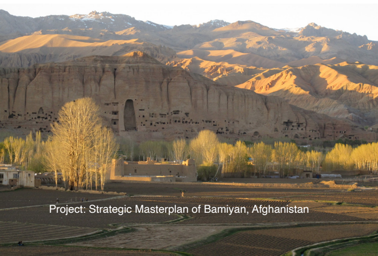
Project: Strategic Masterplan of Bamiyan, Afghanistan

The course is designed for postgraduate students interested in developing advanced theoretical and methodological competences in a number of topics related to Geography, Spatial Management, Heritage and International Cooperation e.g.: valorization of cultural heritage and sustainable tourism, integrated planning and design of urban and territorial development, GIS, remote sensing and Big Data.